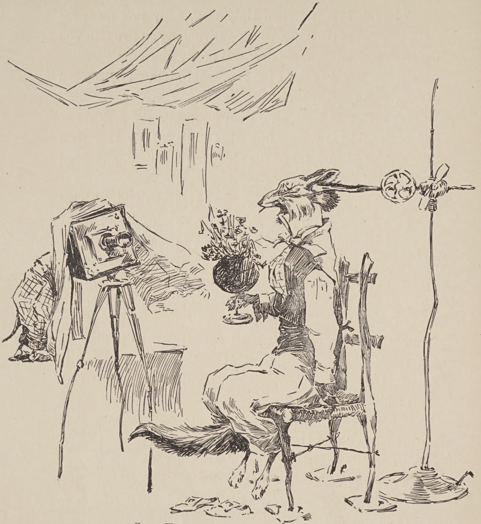
SLY FOX SITS FOR HIS PICTURE.